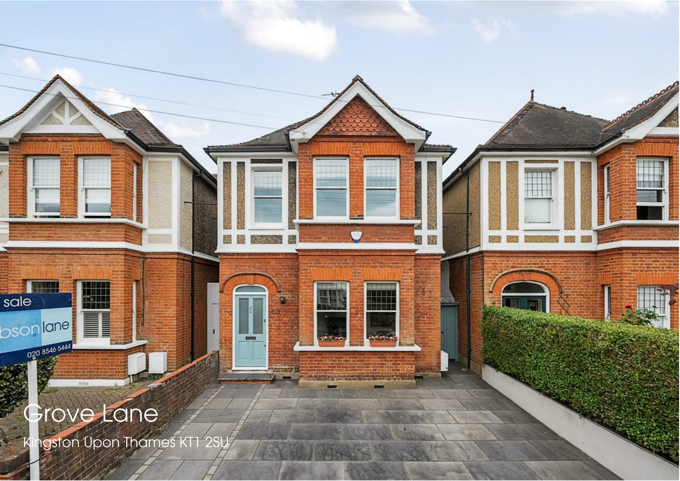
Grove Lane Kingston Upon Thames KT1 2SU